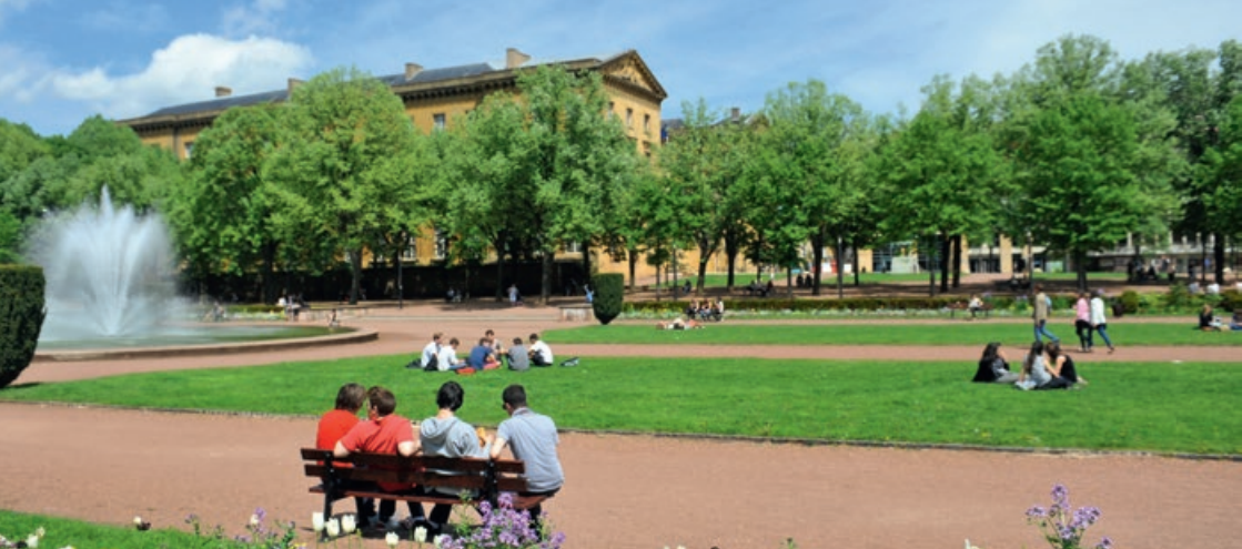
The Esplanade gardens.