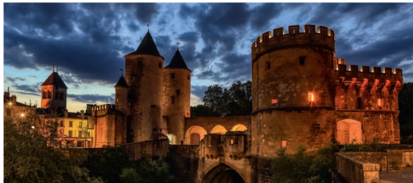
Porte des Allemands - the Germans' Gate.

*Alcohol abuse is bad for your health. Please drink sensibly.