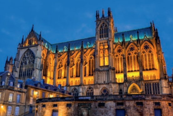
Metz Cathedral.