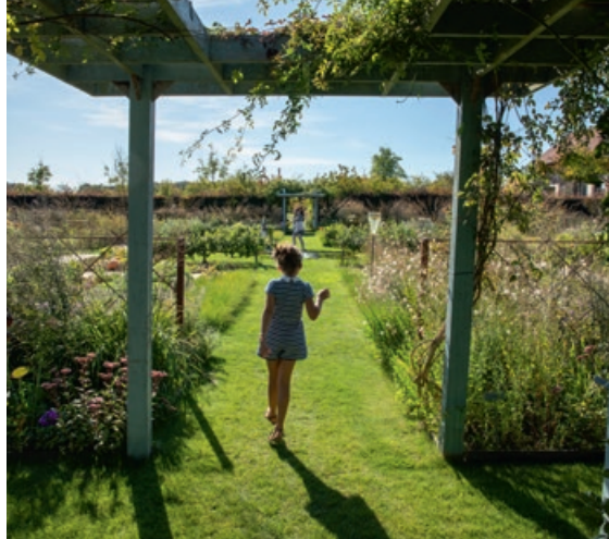
Laquenexy fruit gardens.