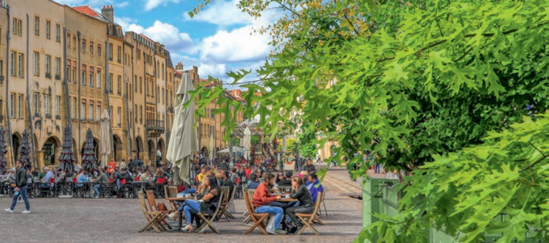
Place Saint-Louis.