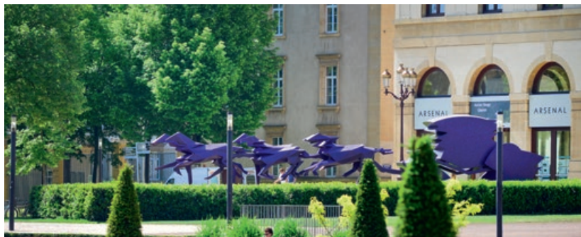
Carrosse de Veilhan.

A French-style garden, emblematic of the city of water and history, overlooking the lake.