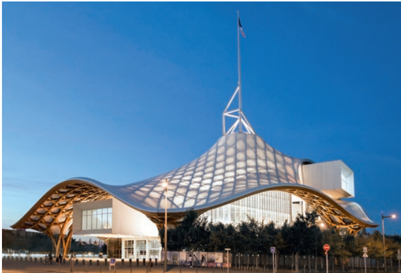
Centre Pompidou-Metz. Shigeru Ban Architects Europe and Jean de Gastines Architects, with Philip Gumuchdjian for the design of the competition's award-winning project / Metz Métropole / Centre Pompidou-Metz