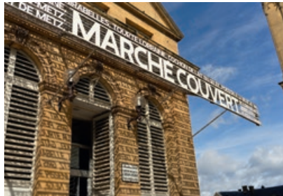
Indoor market.