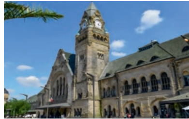
Metz Railway Station

A magnificent neo-Romanesque building with an abundance of symbols and exceptional sculpted features.