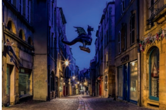
The Graoully - rue Taison.