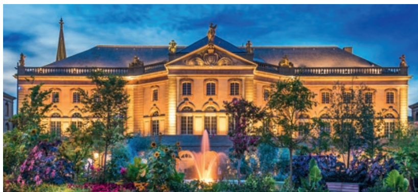
Place de la Comédie / Opéra-Théâtre - Eurometropole de Metz.

Built in the neo-Romanesque style, it sparkles in the River Moselle like a fairytale castle.