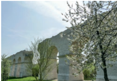
Gallo-Roman Aqueduct.

Flash this QR code to see the complete calendar of events.